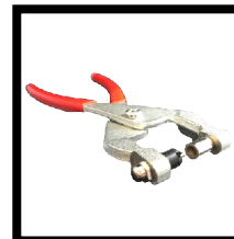
PPK HD Punch Plier