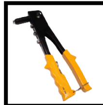
HR-702 Aluminum Riveter (In 2 jaws)