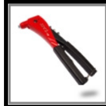
HR-705 Aluminum hand riveter (In 2 jaws) (up to 4.8mm for all material)