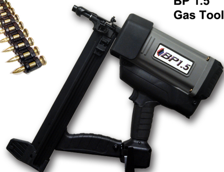
BP 1.5 Gas Tool