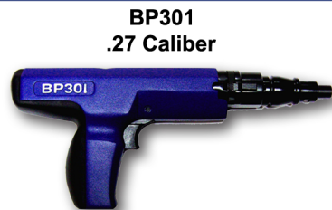
BP301 .27 Caliber