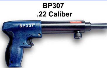
BP307 .22 Caliber