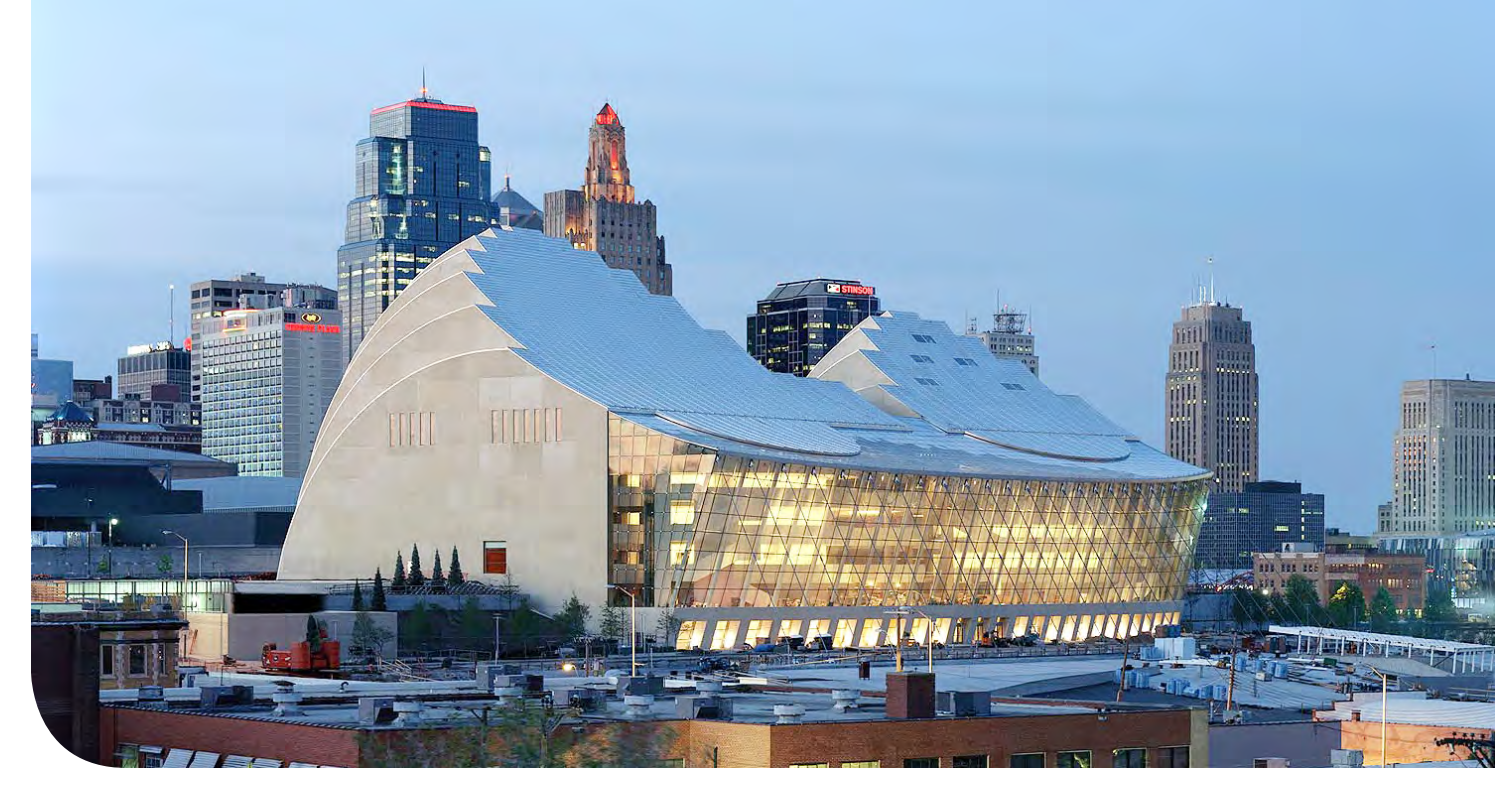
Kauffman Center for the Performing Arts Pecora 890NST Non-Staining Technology™ Silicone