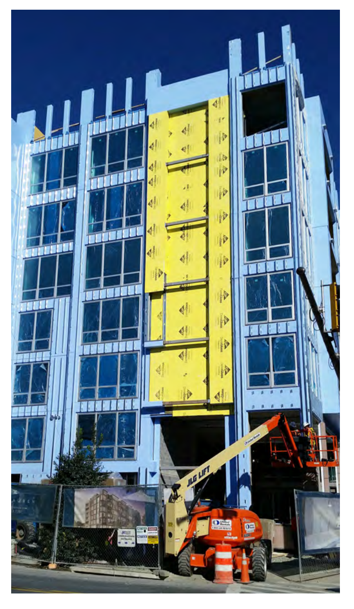
The Lauren Residences

XL-Perm Air, Vapor, & Water Resistive Barrier: Pecora AVB Silicone, XL-Flash, XL-Perm<sup>ULTRA</sup> VP, and XL-Span