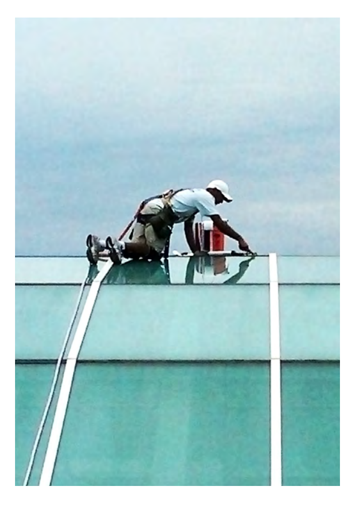
Riverside Center Pecora Silspan Preformed Silicone Profiles and 895NST Non-Staining Technology™ Silicone

Pecora offers a combination of both self-leveling and slope-grade based sealant products that help ensure proper sealing of traffic-bearing control joints, expansion joints in concrete, metal or asphalt, and other areas subject to heavy pedestrian or vehicular traffic.