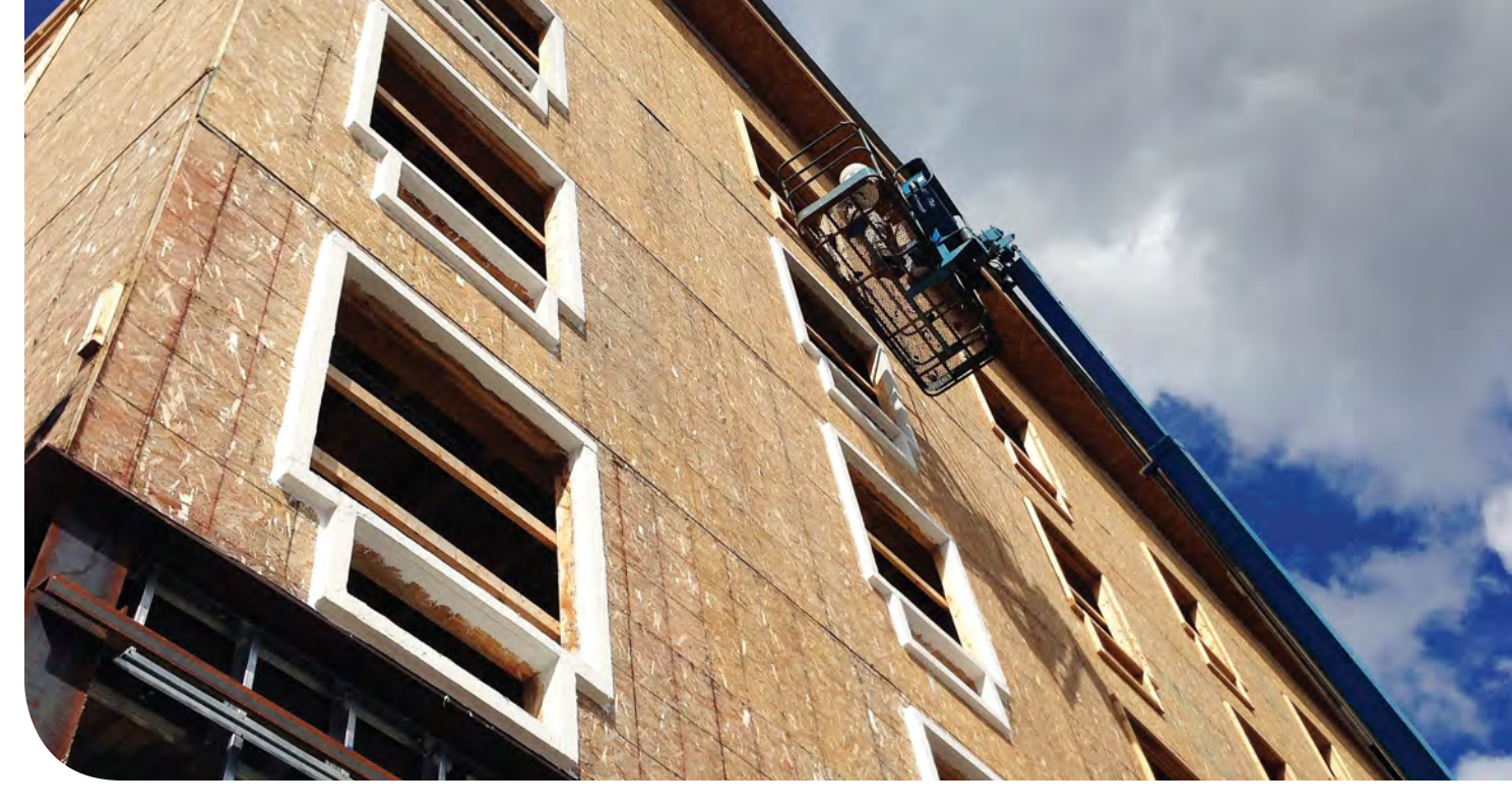
TownPlace Suites by Marriott Pecora XL-Flash STPU liquid flashing