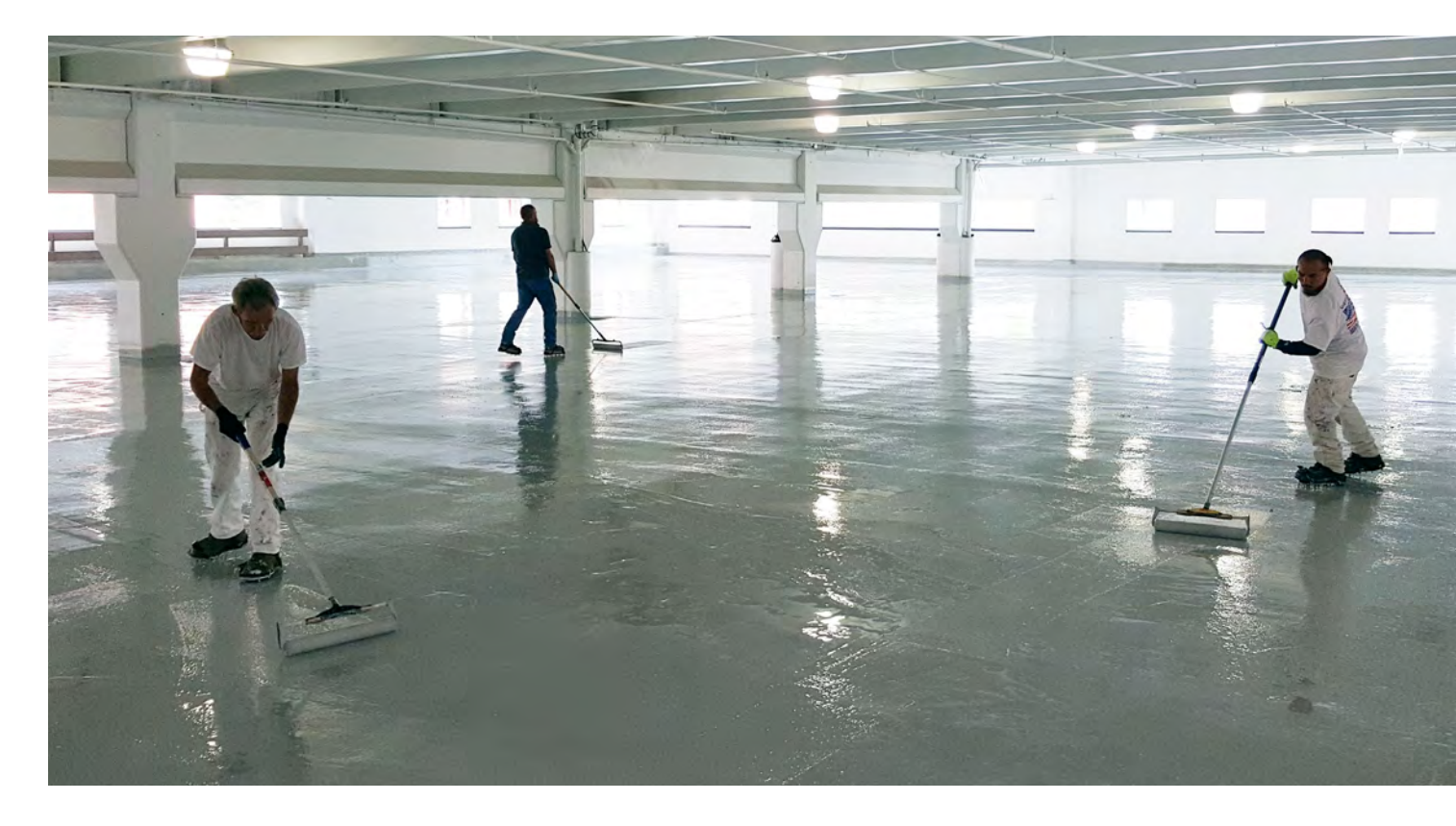
Boise City Hall Parking Deck Pecora-Deck 800 Series — Stone Grey Top Coat