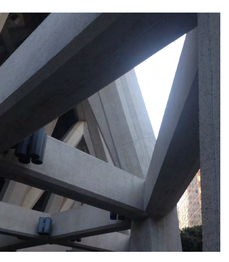
Transamerica Pyramid Pecora 890NST Non-Staining Technology™ Silicone

Our team also provides corporate sales support offering on-site presentations and training by our technical staff with a primary goal of education in product technology and use. Our main goal is to provide you any technical assistance in either the planning or implementation stage of your weatherproofing project.