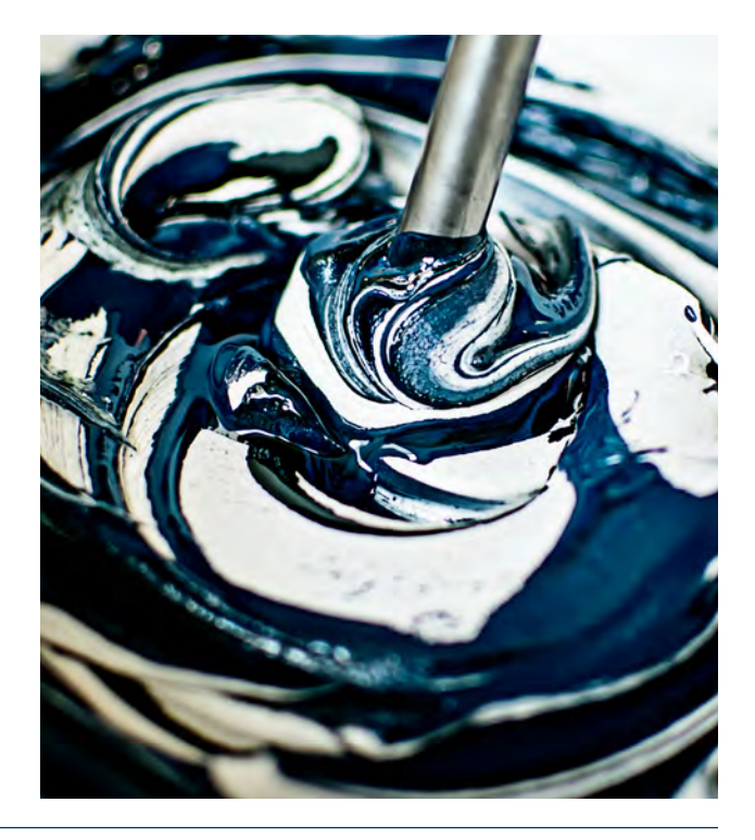
Pecora 890FTS Field Tintable Silicone Patriot Blue

Custom color matching can make all the difference in the appearance of a finished building project. That is why in addition to our many standard colors available, our color match laboratory takes great care to provide the closest custom match possible within a short time frame from receiving the substrate sample. Pecora has thousands of color matches already formulated to work with many leading manufacturers of architectural aluminum windows and Exterior Insulation Finish Systems (EIFS).