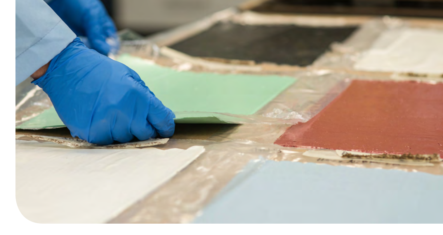
Pecora Technical Service Department